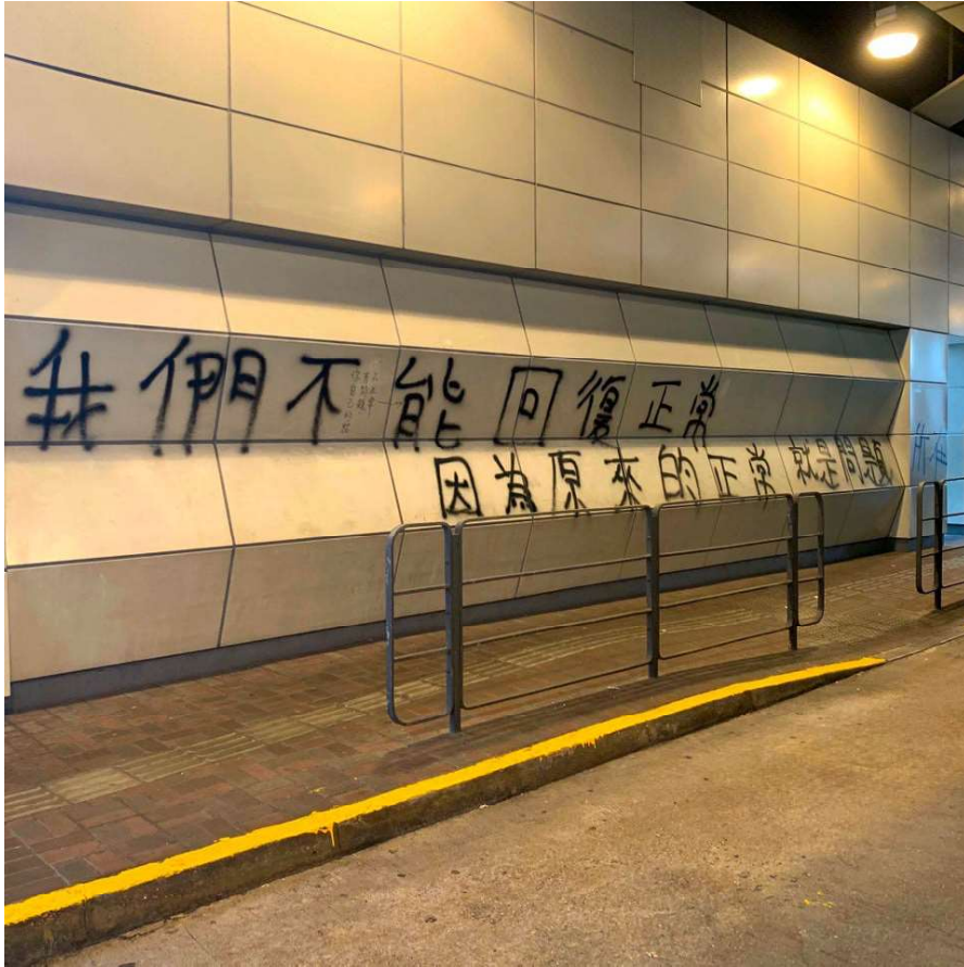
Translation of slogans between Hong Kong and Chilean protests:

Beyond reporting functions, Telegram channels created for specific actions also allowed participants to relay information about needs (medics needed at this intersection, tear gas mitigation tools needed soon) and make collective decisions about responses in real time through voting functions. The latter allowed for quick choices such as which escape route to take to avoid a police attack. Importantly, these organizational methods drew in both militants and those who were unwilling, uninterested or (because of immigration status, disability, or other potential vulnerability to police violence) unable to participate on the frontlines: While frontliners faced off with police and their escalating violence, nonviolent supporters involved themselves in marches, as medics or by providing logistical support (moving barricade supplies, tools for dealing with tear gas, or clothes for black-clad frontliners to change into), as cop-watch with video cameras, or as scouts feeding information to other supporters working as data aggregators.